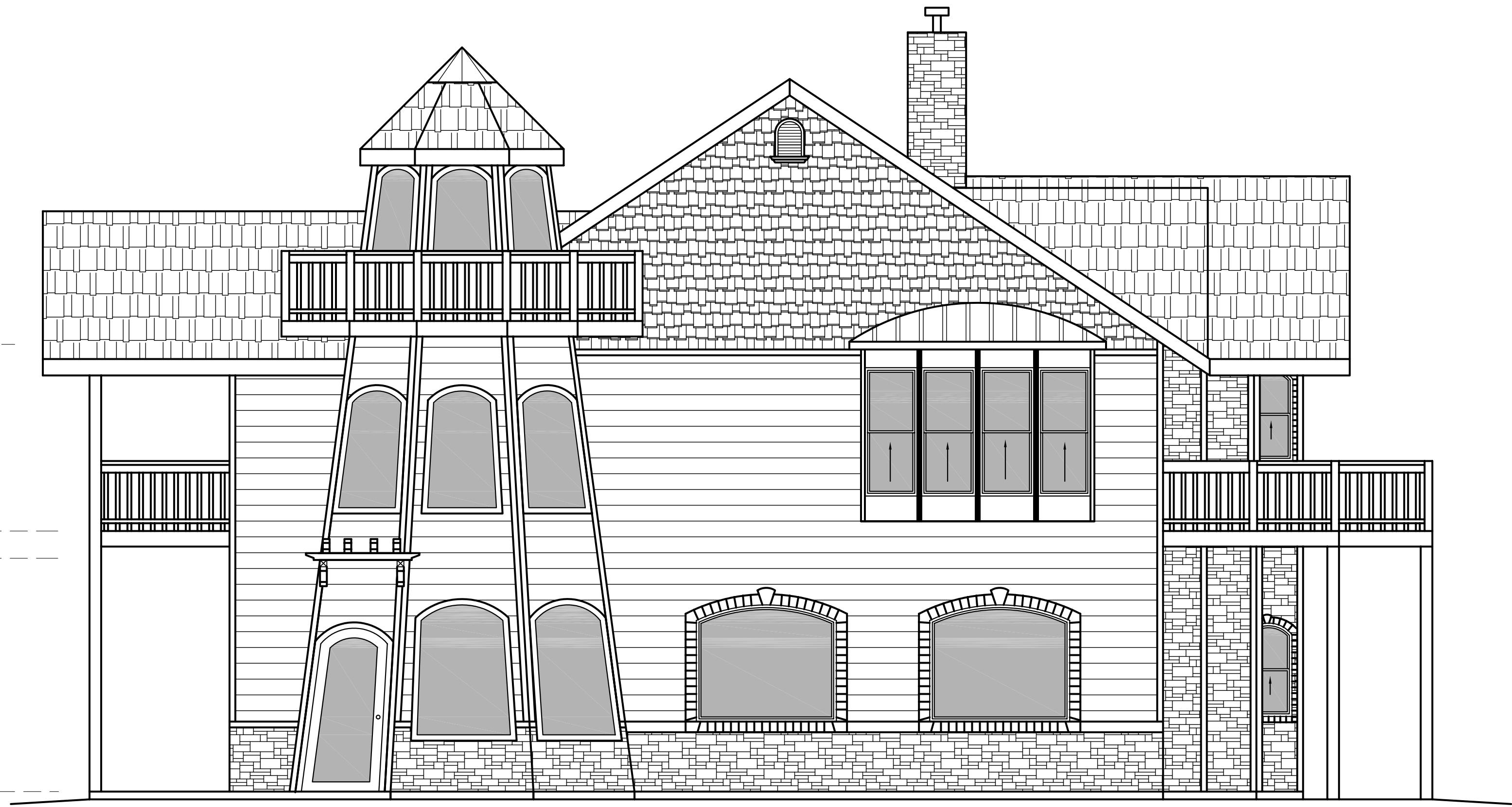
RIGHT ELEVATION SCALE: 1/4"=1'-0"

DRAWN MDS DESIGNED BY CJL DATE 4-26-06 SCALE 1/4" = 1'-0" JOB NO. 00 SHEET A4 OF ... SHEETS