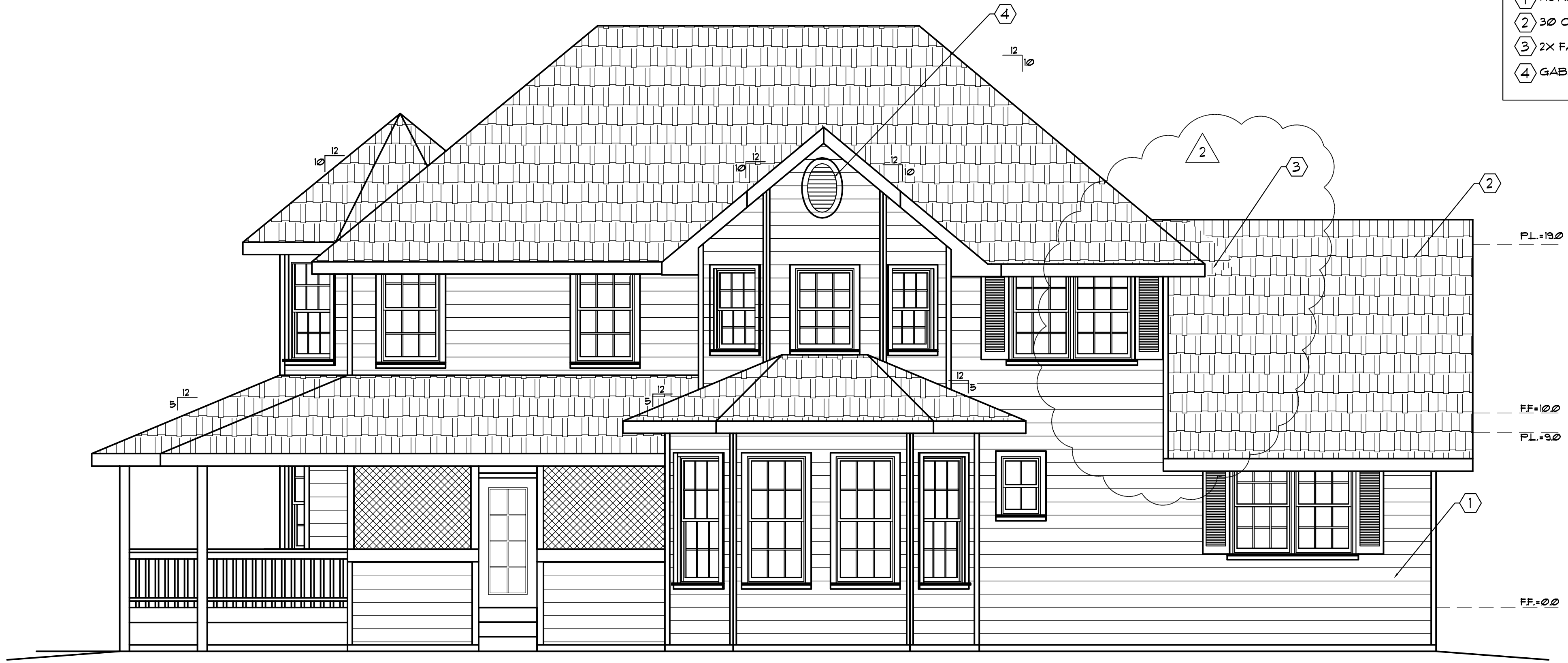
REAR ELEVATION SCALE: 1/4"=1'-0"